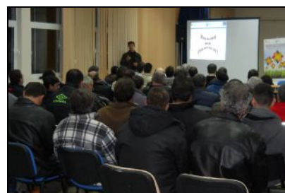
Tabele 1. Timetable of education activities

The aim is to give inputs to local experts to address upgraded reforms and agricultural processes to improve the whole rural governance in the project areas. Education topics were: 1. Aims of EU.WATER project from aspects of soil and water resources in Southeast Banat Region on the territory of Pancevo city; 2. The implementation of the results of the analysis of soil and water through the application of principles and standards in accordance with the Nitrate Directive 91/676/EEC (Directive 91/271) and Water Directive 2000/60, standards prescribed by the European Union; 3. Investigation over the needs for implementing system of monitoring quality of soil and water. Teachers from IAE, Belgrade were Vladana Hamovic Ph.D. Project coordinator (Vice Director of IAE) and Predrag Vukovic M.A. Research Associate, Assistant Coordinator. From Institute "Tamiš" teacher was Director Mileta Stankovic. Invitations for course participants were by phone and e-mail according to associations of agricultural producers and officials who collaborate with IAE, Belgrade at project.